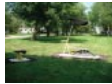
Bike Benches by Dan Schuster 2004