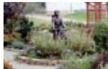
Friend's Garden 2002 Artist Unknown