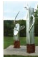
Streamside by Bounnak Thammavong 2005