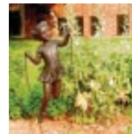
Floyd County Museum Butterfly Garden Children at Play - 2005 Artist Unknown